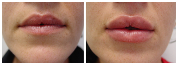
Figure 4 Before (left) and one month after (right) the treatment of upper and lower lips with 2 mL of cross-linked CMC.

had to add it to other synthetic substances. Here are two examples: